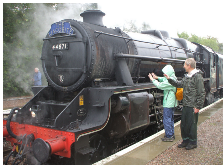
Photo 4. Sometimes it's 'dricht', but there's always somewhere to warm your hands in Scotland. Black Five 44871 on Fort William – Mallaig line.