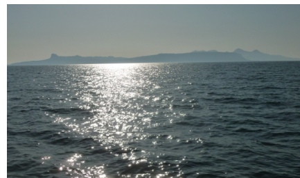
Photo 6. Scotland's always evocative. Get yourself on the Sheerwater ferry from Arisaig to Eigg and shin up An Sgùrr, the pitchstone 'prow' far left.