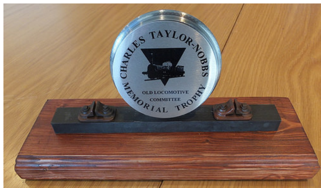
Photo 7. The chosen Charles Taylor-Nobbs Trophy, comprising a baseboard surmounted by a sleeper and chairs with a centrally mounted steel wheel upon which is secured the citation.